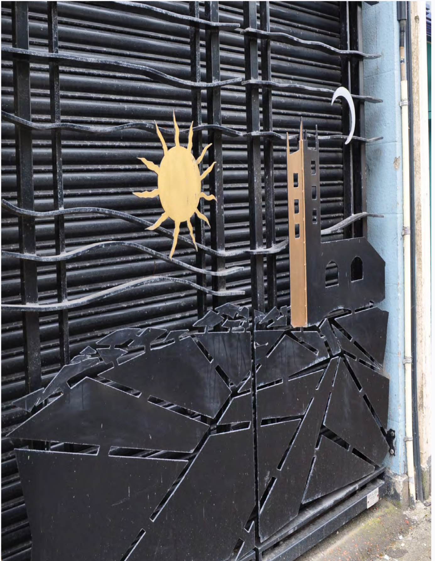
Tara Centre Omagh—An exciting artistic gate design to represent our rural landscape.