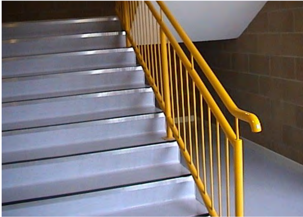
Gortatole Community Centre— Yellow PPC tubular railings both to balcony and stairs