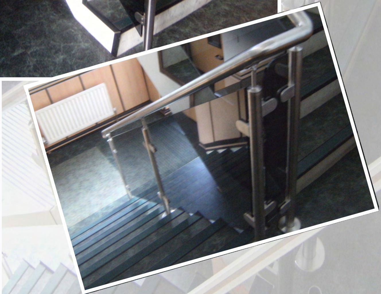
Trade Mouldings—Stainless Steel Balustrade to stairs with tinted glass